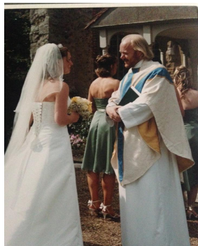
Once I had hair...

I work easily with colleagues across the whole diversity of the Church of England. My last spiritual director was a member of SSC; I have successfully planted a New Wine style congregation in a parish; I'm a Greenbelter and I love the BCP I don't fit in a box – who does?