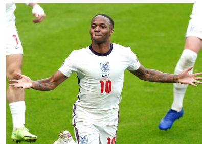
I'm a bit of a footie nut

We shall not evangelise England with an emaciated incarnation. We need a much more theologically sophisticated understanding of the nation – and then, with that, a clearer understanding of what it means to be the Church of England in our time – for this time is very ripe